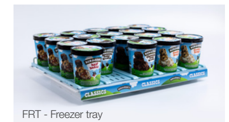
FRT - Freezer tray